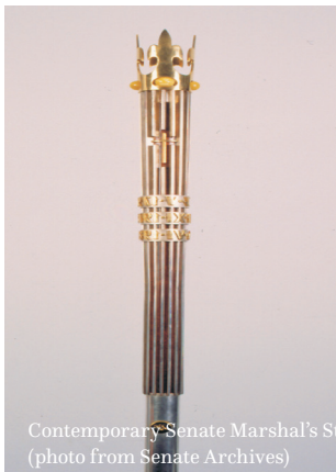
Contemporary Senate Marshal's Staff